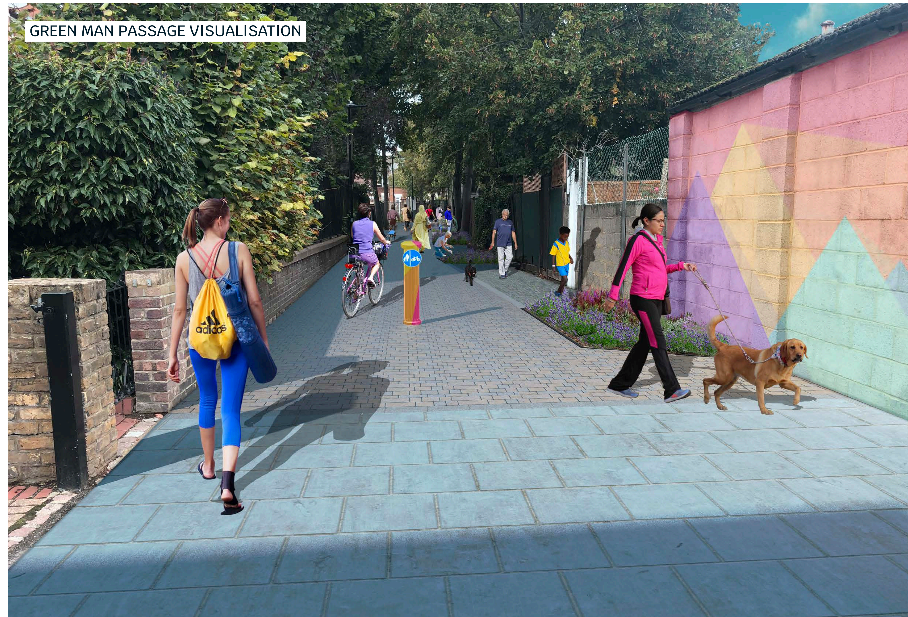
GREEN MAN PASSAGE VISUALISATION